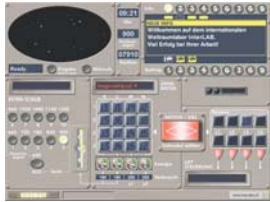
Screenshot of "Main Deck"