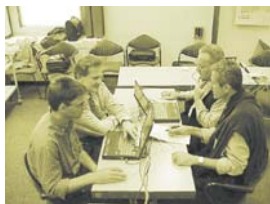
Team of 4 during Session