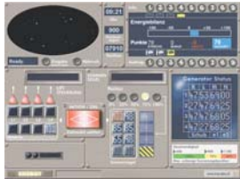
Screenshot of "Support Deck"